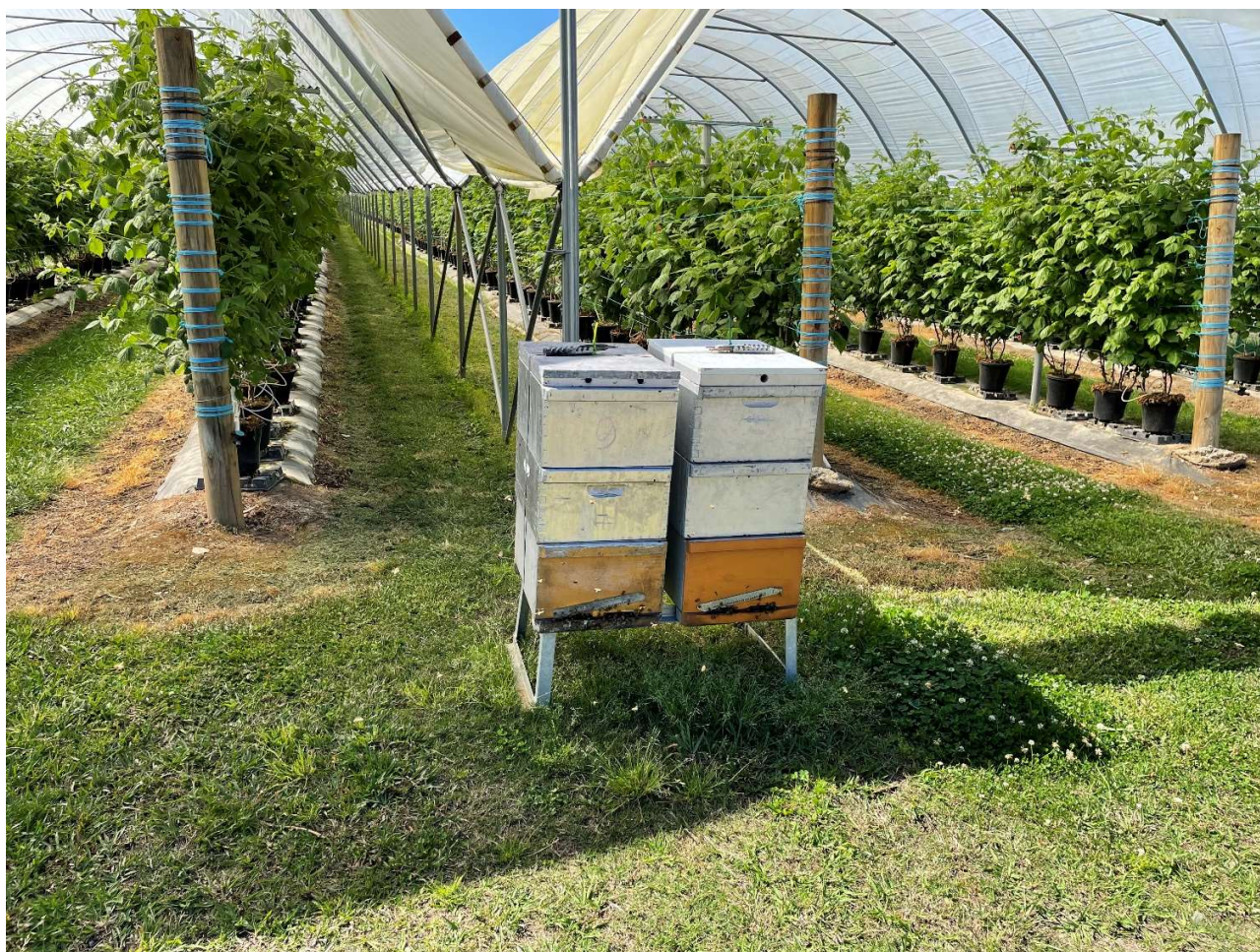
Bees working tunnels on raspberry pollination

Supporting Australia's national beekeeping industry that supports you