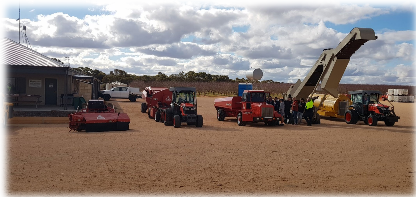
South Australian Apiarists Association Education Day – Equipment used to harvest almonds

Do you have some content you would like us to share? Tag us or use #AHBIC for us to see!