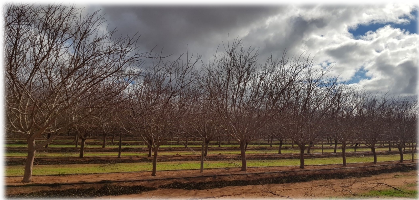
Photo - South Australian Apiarists Association Education Day – Almond orchard

Supporting Australia's national beekeeping industry that supports you