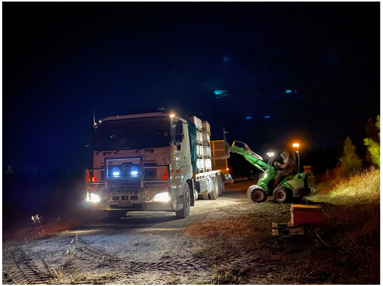
Loading hives for travel to almond pollination.

Or use the form on the last page Supporting Australia's national beekeeping industry that supports you