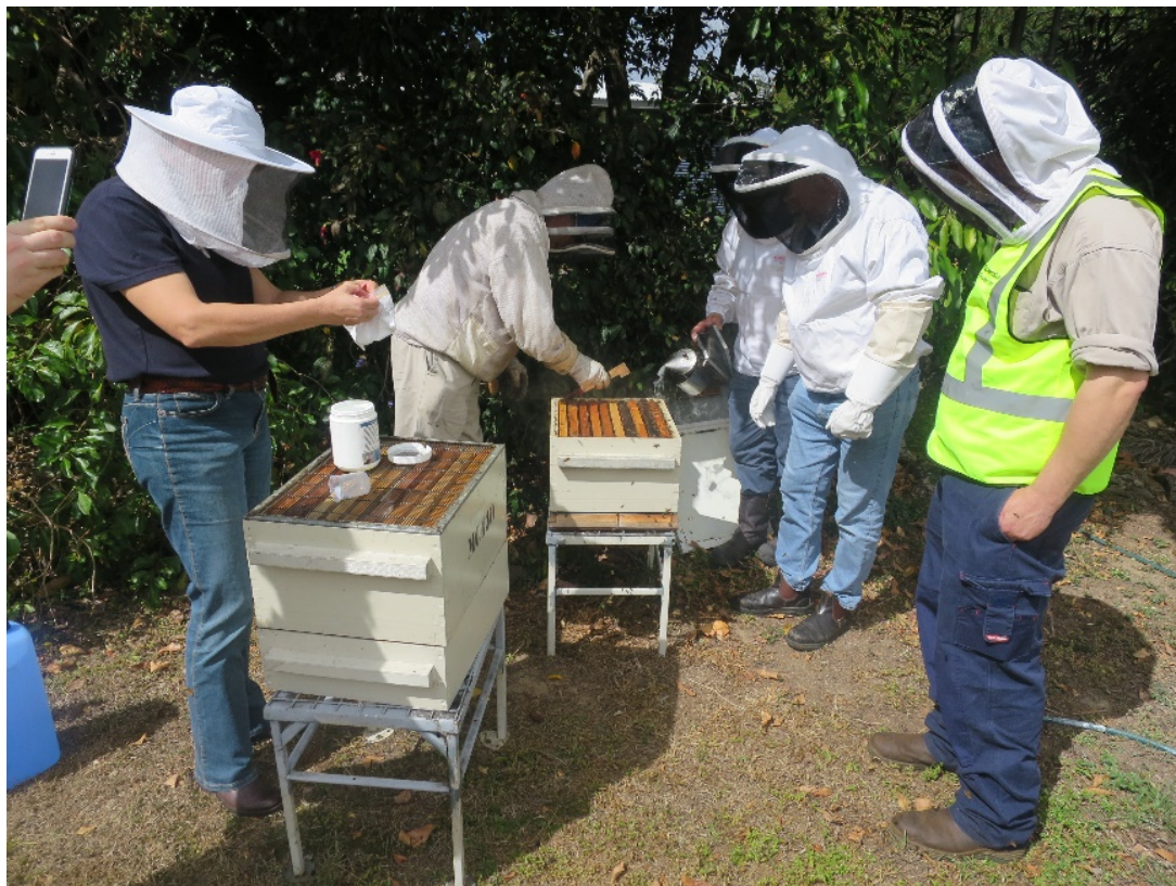
Teaching local beekeepers how to use the sugar shake method of mite detection

After the agreement to the eradication plan in 2016, AHBIC organised and paid for beekeeper volunteers to go to Townsville to help out with the program. Initially the main emphasis for the volunteers was to train the local beekeepers in how to conduct sugar shakes, alcohol washes and drone uncapping to check for Varroa. Thanks to those volunteers for their work. Also there were bottom boards put on hives that allowed for sticky mats to be put in when the acaricides strips were put in the hive and the volunteers were able to do this work. As it had been reasoned from the beginning that Varroa jacobsoni would probably not be reproducing on the honey bees the same way as Varroa destructor does, then it was vital that local hives be tested on a regular basis. The experience from Papua New Guinea was that it took up to 20 years before Varroa jacobsoni learnt how to reproduce on honey bees. So no destruction of hives was carried out but monitoring was vital. There was no movement of hives allowed out of the Townsville City Council area.