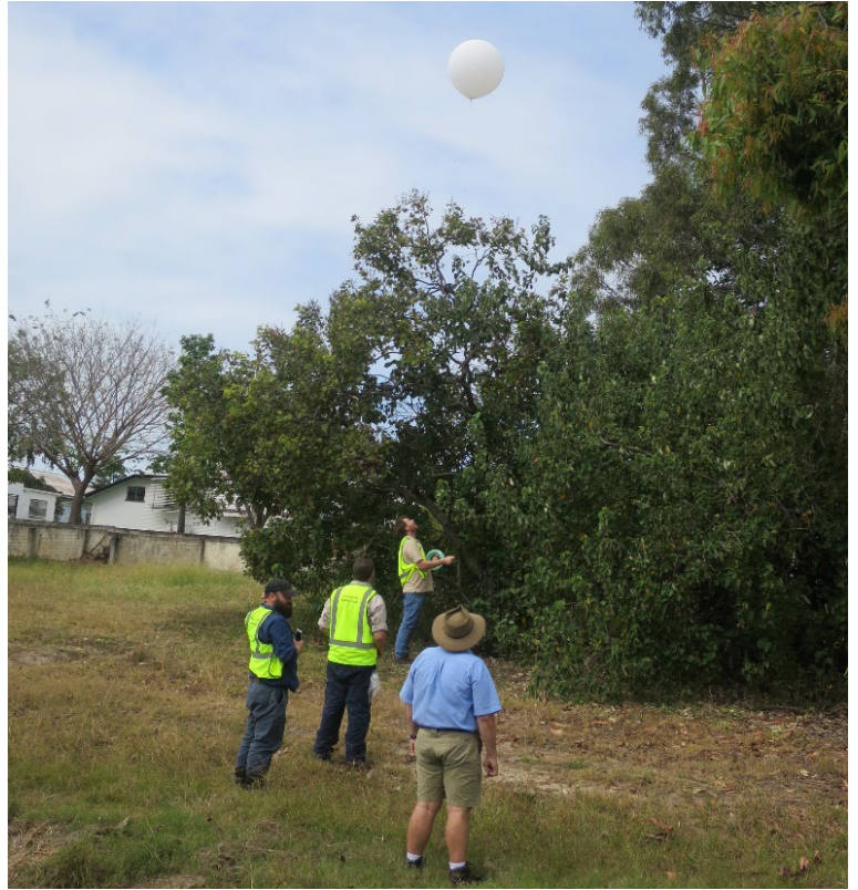
Using helium balloon to attract Asian bee drones

AHBIC thanks the contribution of these industries to the eradication program.