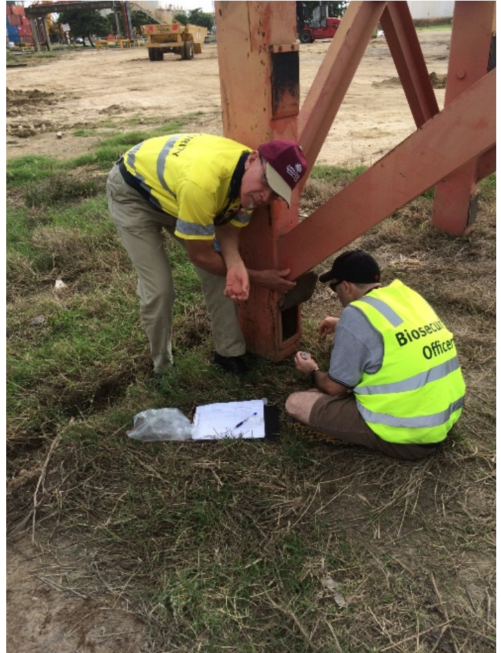
2016 nest

Whilst the eradication program for the 2016 incursion was being enacted, there were two other separate incursions from unrelated Asian bees found at the port of Townsville and these also had Varroa jacobsoni on the bees. These were in May 2019 and April 2020. Examination of the comb showed that these had not been there for long before they were discovered.