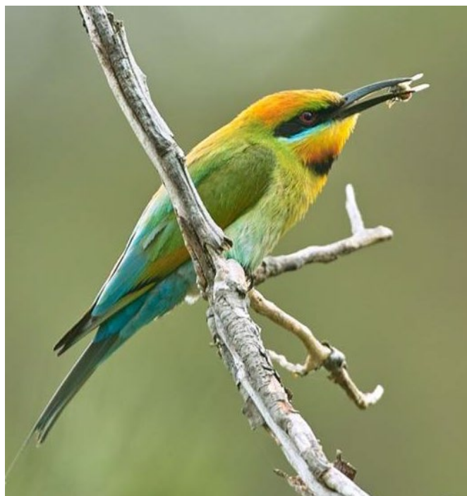
Rainbow bee eater bird