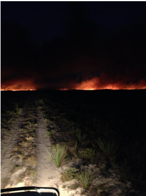
Ngarkat Fire

Most would be aware of the recent fires in South Australia and Victoria. A lot of these fires were started by lightning strikes from dry storms.