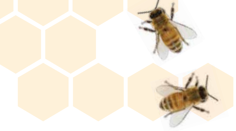
"This little animal is a valuable asset to Australia's agricultural future and long-term prosperity"